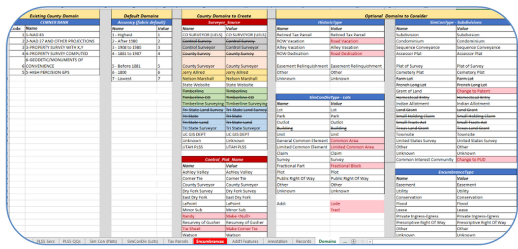
Sample Data Matrix

Every data migration project begins with a consultation and thorough analysis of the County's current data for the creation of a Data Matrix document from which the final geodatabase schema can be created. The data matrix is an Excel file in which all current data will be noted, details defined, and process needs described. County staff and Pro-West will discuss the current state of the data and what is needed. This will ensure that the County and Pro-West have documented all current and final data schema needs thus avoiding disruption during the data migration process.